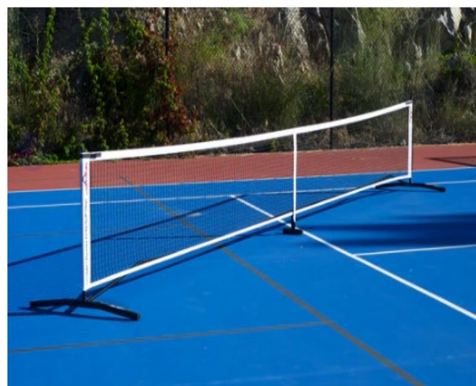
Photo #1 – Genesis Fieldhouse. 3 Pickleball courts. Green lines all around.